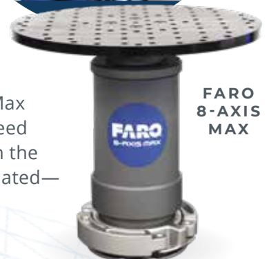
FARO 8-AXIS MAX