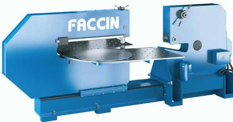
Circular Shears and Flanging Machine for Flat Heads Series CB