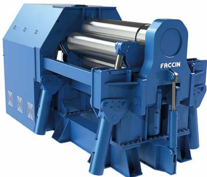
4-Roll Double Pinch Bending Roll Planetary Guides Series 4HEP