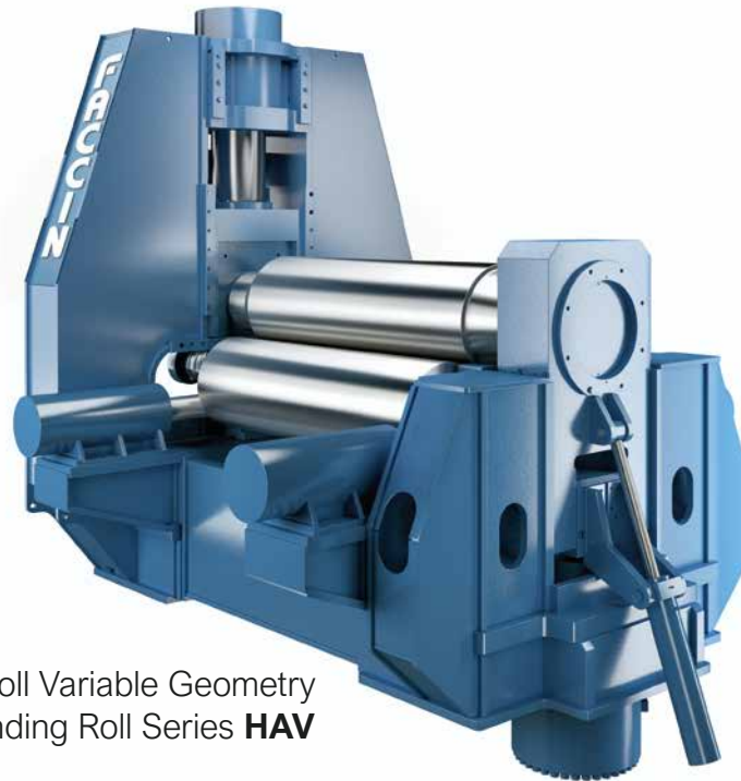
3-Roll Variable Geometry Bending Roll Series HAV