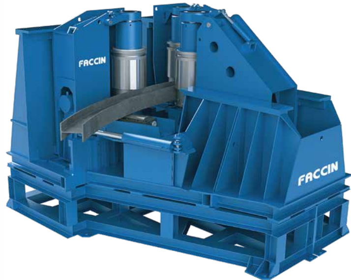
3-Roll Variable Geometry Series TAURUS