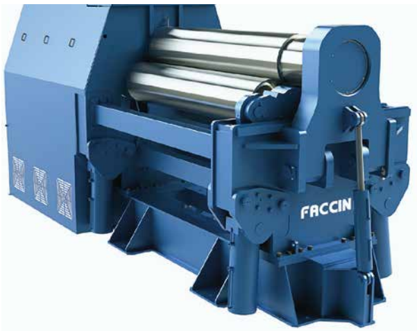
3-Roll Double Pinch Planetary Guides Series 3HEP