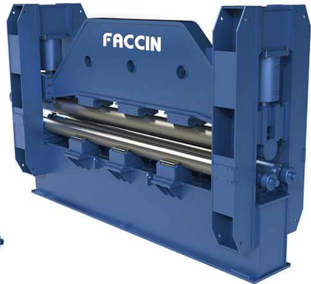
3-Roll Bending Roll for Shipbuilding and Aerospace Industry Series RP