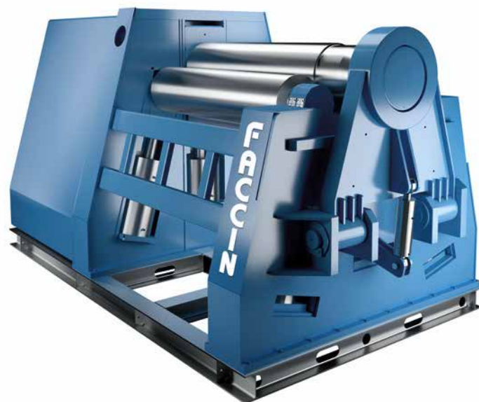
4-Roll Double Pinch Bending Roll with Linear Guides Series 4HEL