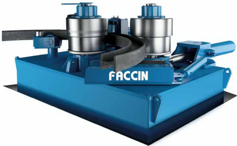
3-Roll Double Pinch Section Rolls Series RCMI