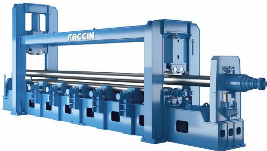
3-Roll Plate Rolling Machine for Pipeline Production Series HAV-2P