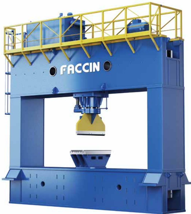
3D Forming Portal Press for Shipbuilding Series PPS