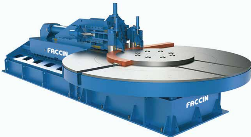
Rotation Table Ring Roller Series GIOTTO