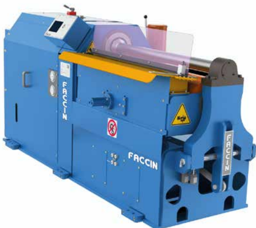
2-Roll Plate Bending Machine with Urethane Roll Series HCU