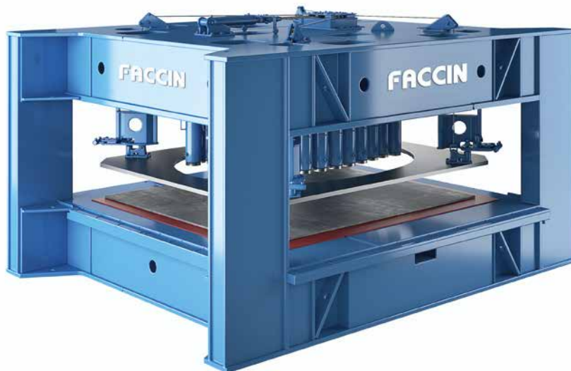
Hydroforming Press for Polycentric Dished Heads Series PPH