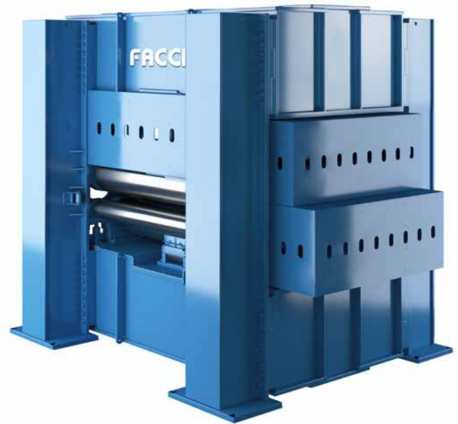
Plate Straightening Machine Series R