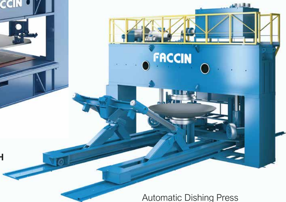
Automatic Dishing Press with Manipulator Series PPM + MA