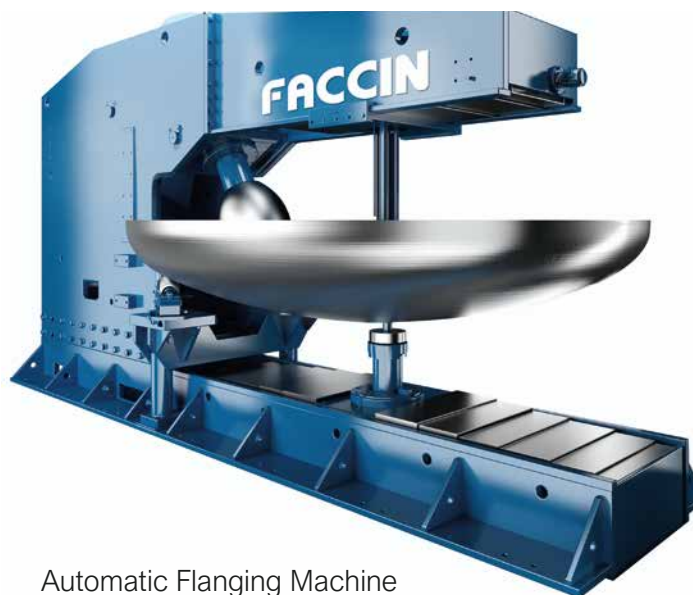
Automatic Flanging Machine Series BF