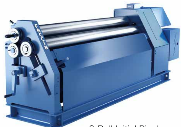
3-Roll Initial Pinch Bending Roll Series ASI