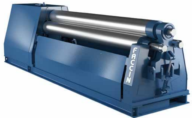
3-Roll Double Pinch Bending Roll with Linear Guides Series 3HEL