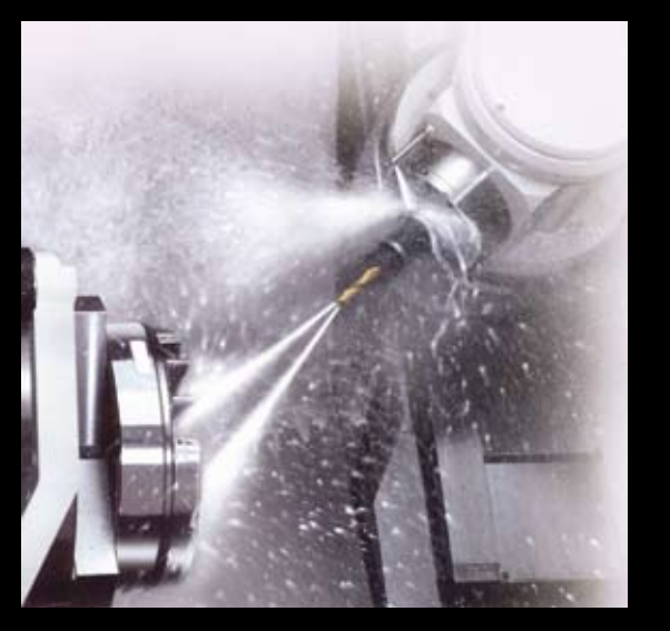
Mazak Integrex 400 – Mill Turn Machine.

The company is highly experienced in designing the necessary workholding required to machine accurate, but affordable, components. (See our Workholding Brochure).