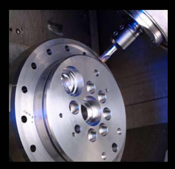
Typical Sub-contract Machining

In-process gauging is complemented by 100% inspection of critical dimensions. Rigid controls are maintained on outside suppliers and services.