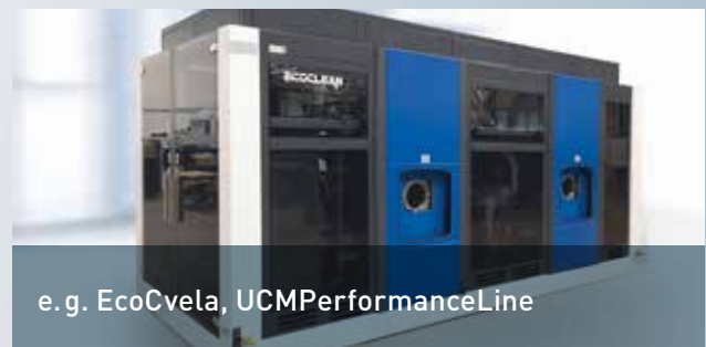
e.g. EcoCvela, UCMPerformanceLine

Chamber cleaning/Inline immersion system